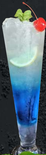
CALIFORNIA ICE TEA