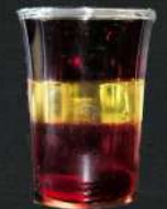
LOCH NESS MONSTER