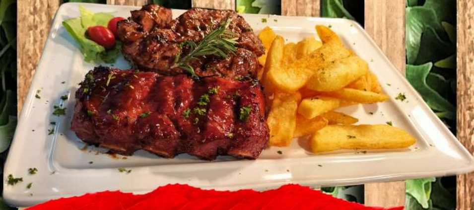
RUMP AND RIBS