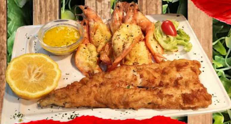
HAKE AND PRAWNS