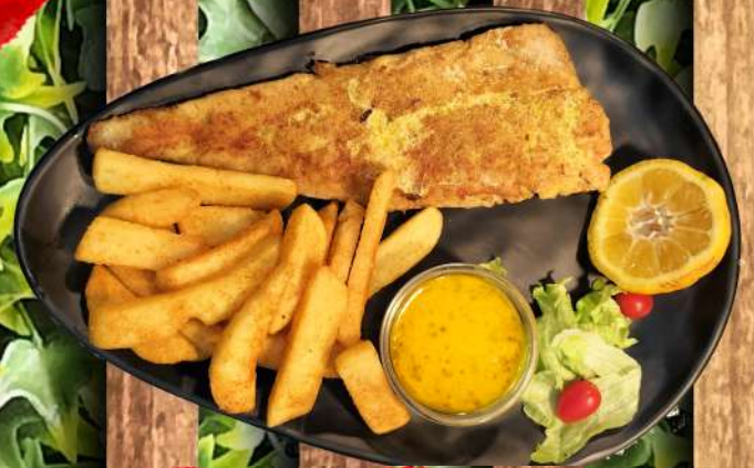
HAKE AND CHIPS