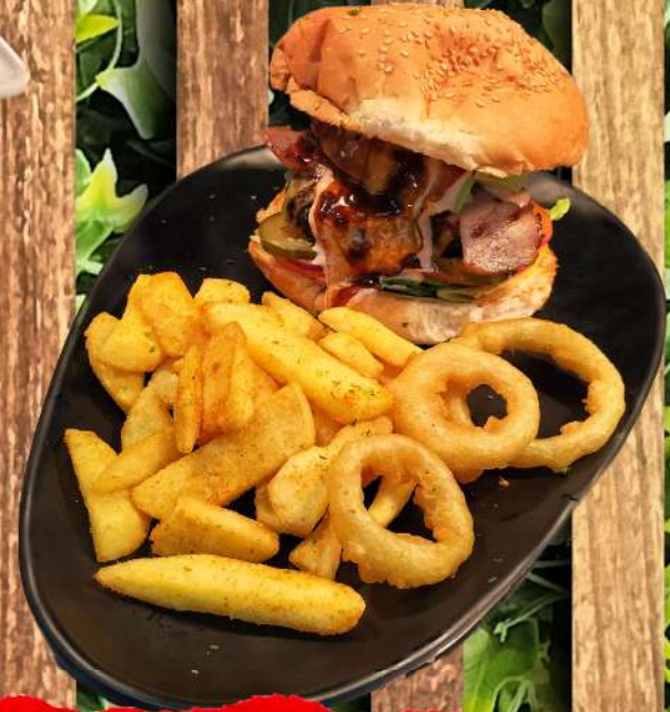
BACON & AVO BURGER